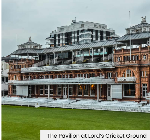
The Pavilion at Lord's Cricket Ground