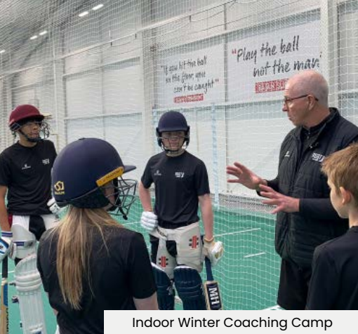
Indoor Winter Coaching Camp