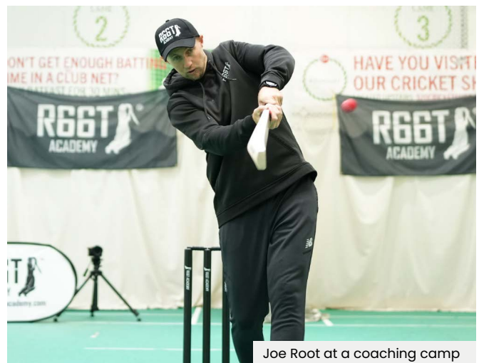
Joe Root at a coaching camp