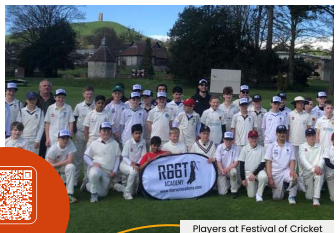
Players at Festival of Cricket