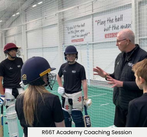
R66T Academy Coaching Session