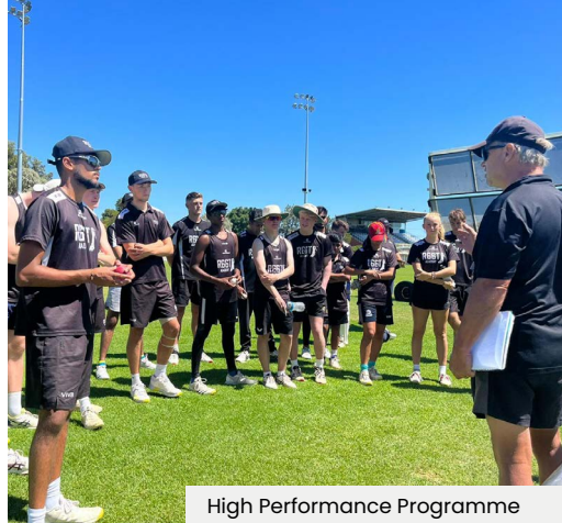
High Performance Programme