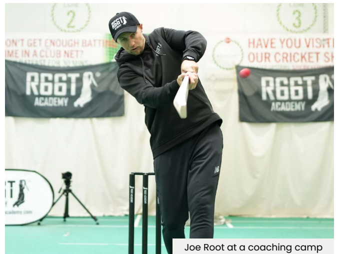
Joe Root at a coaching camp