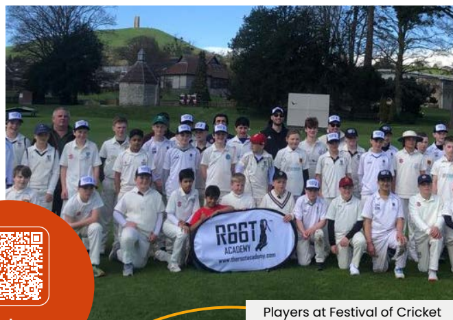
Players at Festival of Cricket