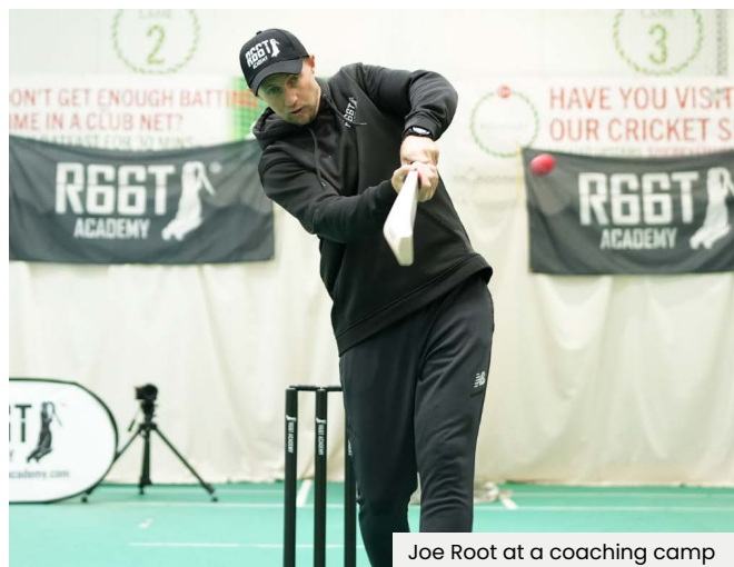
Joe Root at a coaching camp