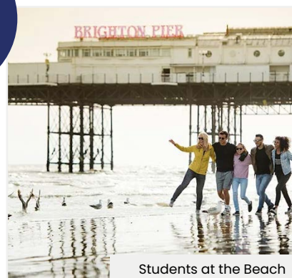
Students at the Beach