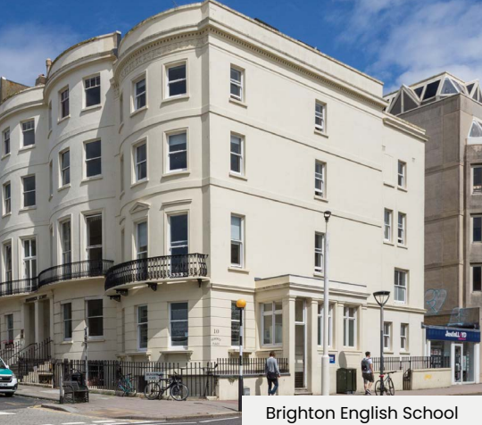
Brighton English School