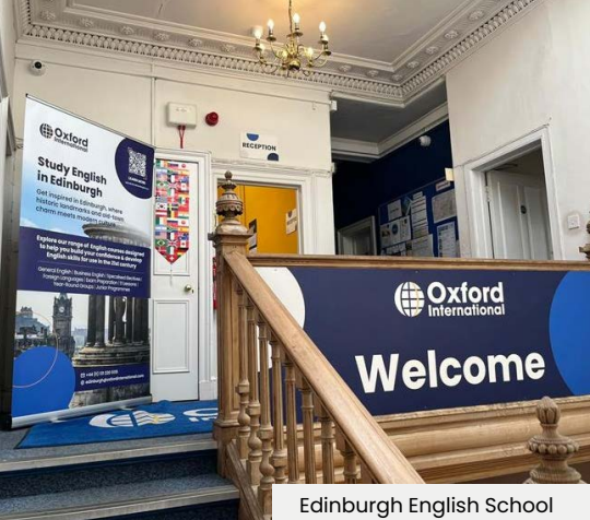
Edinburgh English School