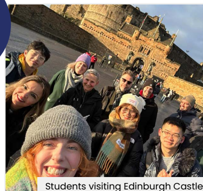
Students visiting Edinburgh Castle