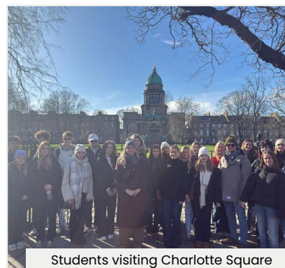
Students visiting Charlotte Square

*Activities are a sample only and can change depending on the length of the programme.