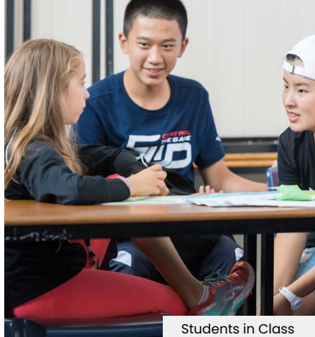
Students in Class